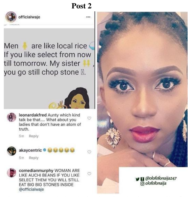
In post 2, we see a comparison of men to local rice (mostly local Nigerian rice that is not well refined hence, it contains stones and pebbles from the farm from which they were harvested) that has a lot of stones in them. The sexist language here is directed at men. Men are portrayed as not perfect and cheats in their various homes. No matter the level of care and caution a lady takes, the man is predictive. He would turn out bad as expected. This can also imply that men are not well refined just like the local rice. The post relies on a comparison of two objects (men and the local rice) which are familiar to their friends and audience in other to drive the message. There is a sense of generalisation attached to this post and the previous one we looked at. This is however justified on the basis of the fact that sexist language works with stereotypes and stereotypes rely on generalisations.

The post above is a conversation between a son who wishes to get married and his father. The father insists on the son saying the word 'sorry' without having any reason to do so. The boy is confused and wishes to know why he has to say 'sorry' but he eventually yields to the father's demand by saying 'sorry' after which the father says his son (the boy) is ready for marriage. Though the post does not refer to women in the text, there is, however, an implied meaning linking women and irrationality, which makes the post sexist. The boy has to be ready to say sorry (to a woman) without no cause. Here, a woman who the boy would get married to would demand that the boy says sorry countless times even if there is no reason to do so. The content of this post implies that women are not logical in their thinking as thet just want men to keep apologising and it makes them happy.