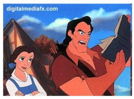
"Women don't read!"

The post above conatians a picture of a man holding a book and a lady at her back (possibly his wife) staring at the book from a distance with a wriiten text: 'women don't read.' They only stare at the book when their husbands or the male folks are reading and then wait for the men to tell them what is in the book. This shows that women are not intellectauls. They are lazy and they are not ready to learn new things. This is aimed at demeaning the female folk which the aim of sexist language. This is very similar to the two posts below: