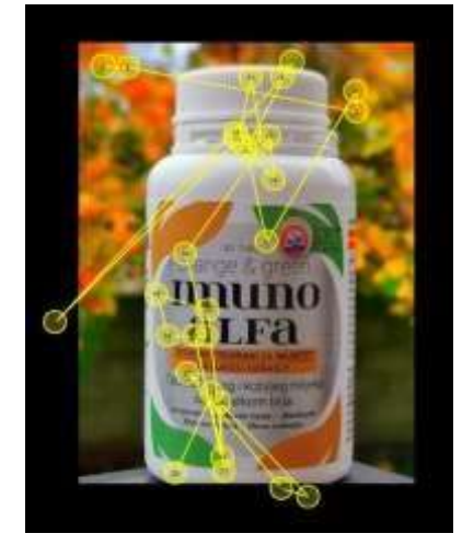
Figure 4. Gaze patterns.