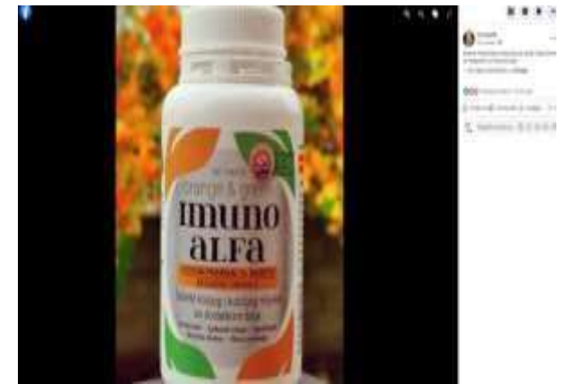
Figure 1. Experimental setup of Imunoalfa on Facebook page.

with each other. In this way it was possible to understand which parts of image had greater visual attention and with the one-way repeated measure ANOVA statistically verify if there is a significant difference within them. A heat map and static gaze visualizations were also obtained to get the graphical representation of where the highest number of fixations on the image was. The activity in EEG electrodes F7 and F8 was used to calculate frontal alpha asymmetry index, while statistical analysis was performed to assess the difference between these electrodes.