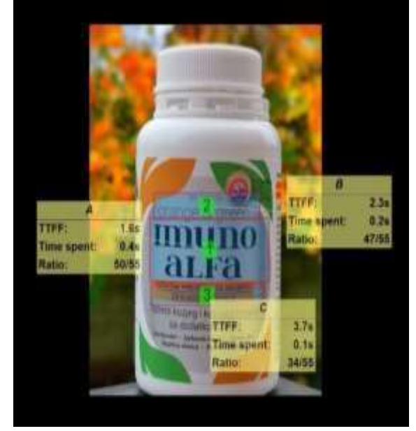
Figure 2. Areas of Interest (AOIs) used in evaluating product packaging design for Imunoalfa.

The following measurements were taken to assess packaging design to identify how well the brand is positioning itself on the subconscious level: heat map, static gaze visualization, time to first fixation (TTFF) (average amount of time needed for subjects to notice specific AOI from the stimulus onset), percentage of participants who fixated on the target (AOI) (percentage of how many of the subjects that saw the stimulus actually saw the AOI), duration of the first fixation on the target (AOI) (how long first fixation lasted for), time spent fixating on the target (AOI) (average amount of time subjects spent looking at a specific AOI) and frontal asymmetry (a marker of approach and avoidance). Three target areas (AOIs) are depicted on the Figure 2.