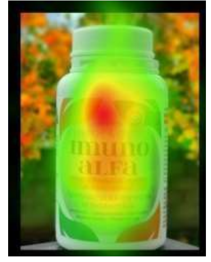
Figure 3. Attention results based on the heat map.