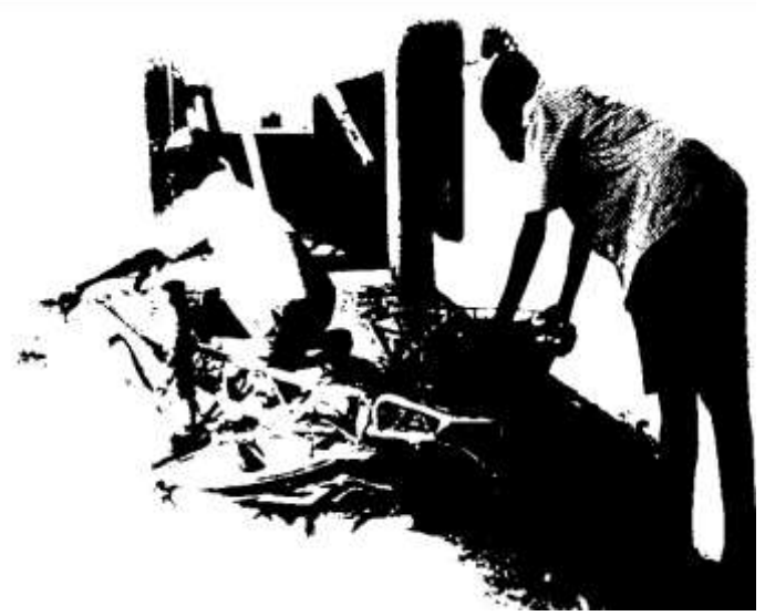
Figure 10: Children from Abraka Model Primary School Playing with Sculpture model 5, 2016, Photograph: Okogwu Antonia