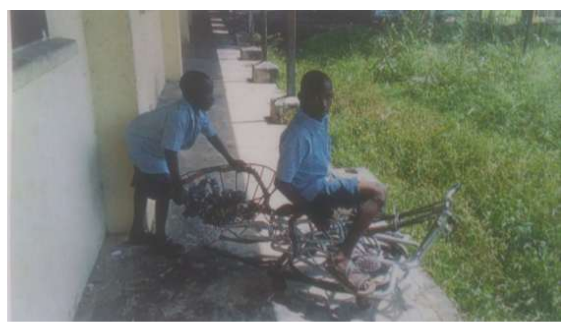
Figure 12: Children from Abraka model primary school playing with play sculpture model 7, Photograph: Okogwu Antonia, 2016