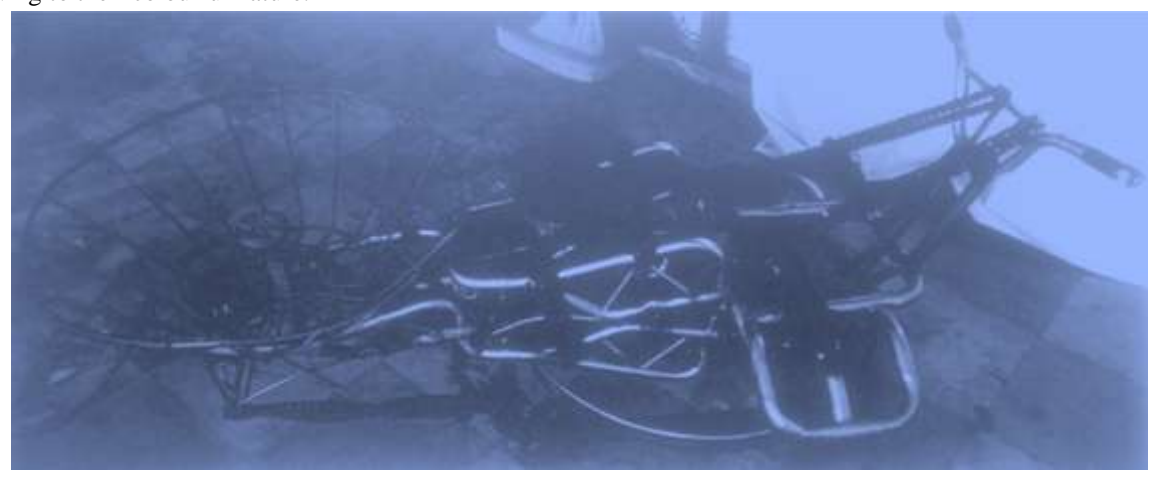
Figure 4: play sculpture model, metal, plastics, 2014

Spraying the form with only two colours of black and silver and attaching some stringed dices flip-flops to catch the attention of the children owing to their colourful nature.