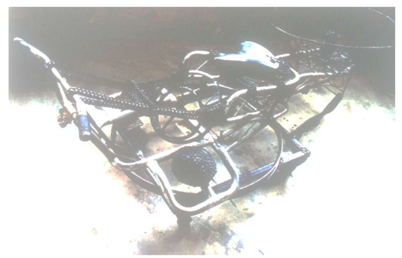
Figure 5: Play Sculpture Model 2, bicycle, chains, seat and wheel, metal rings, chrome motor cycle fenders, metal basket and angle bar. 53.34cm x 147.32cm (1ft.9ins x 4ft.10ins), 2011.