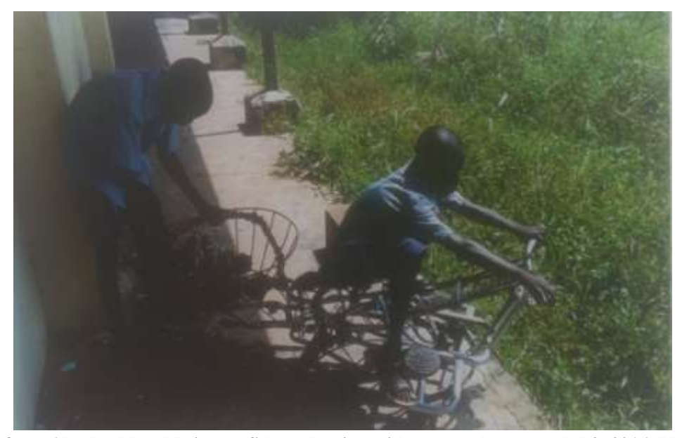
Figure8: Children from Abraka Model Primary School Playing with play sculpture model 3, 2016, Photograph: Okogwu Antonia