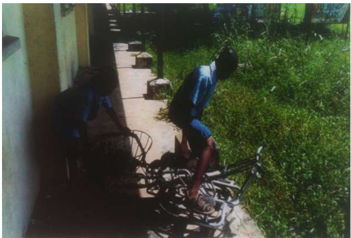
Figure 6: Children from Abraka Model Primary School Playing with play sculpture model, 1, 2016, Photograph: Okogwu Antonia

This play model was purposely placed in places where people could interact with and it turned out that both adults and children rode on it.