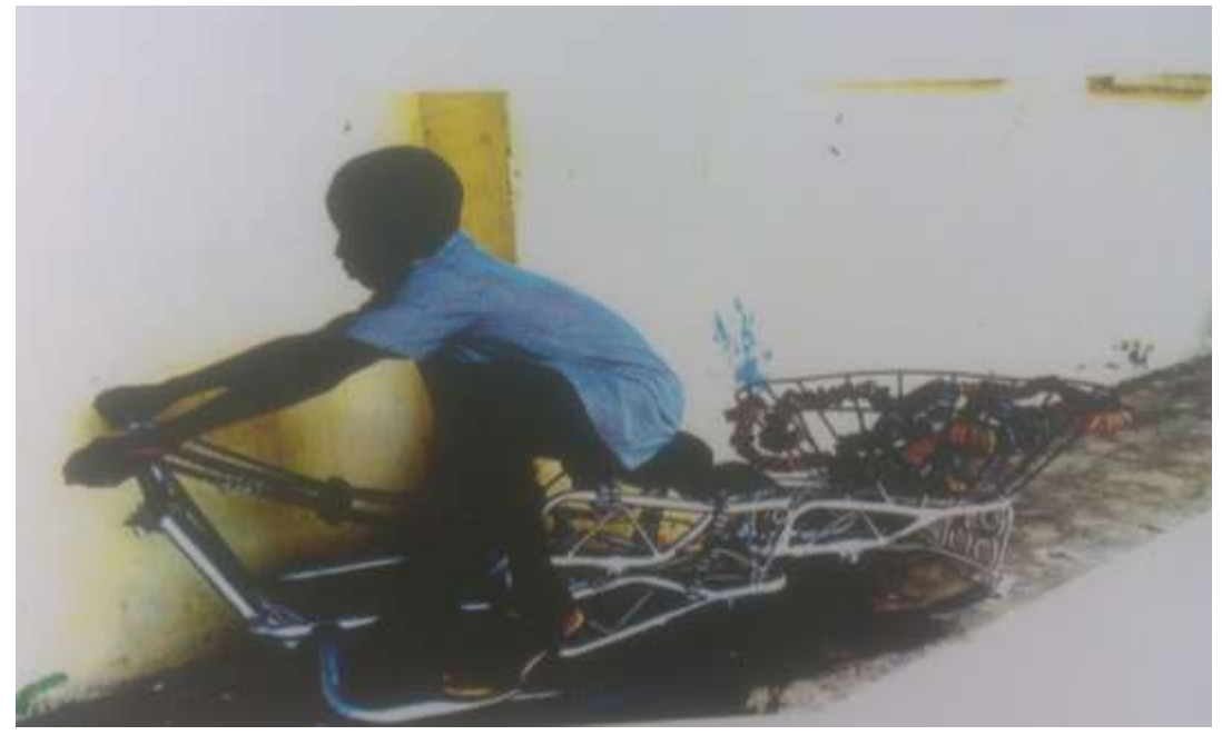
Figure 7: Children from Abraka Model Primary School playing with play sculpture model 2, 2016