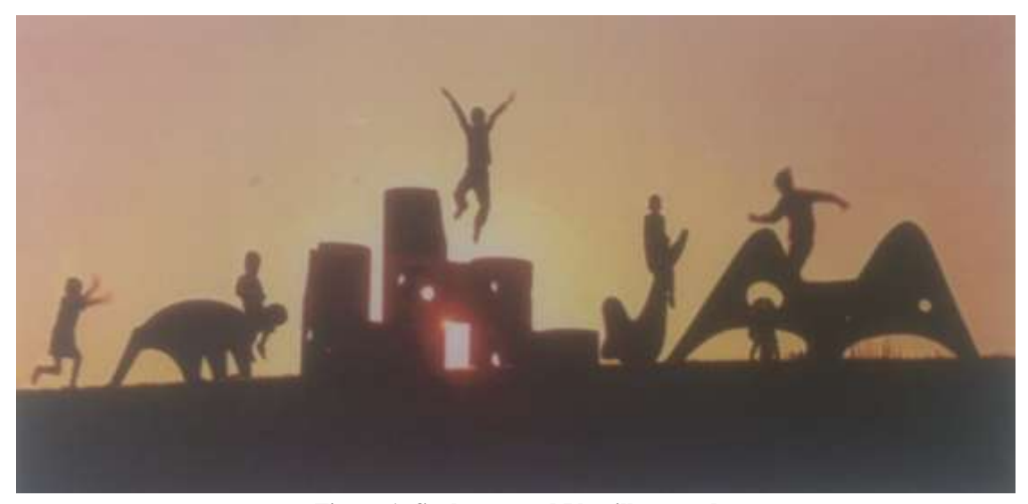
Figure 1: Sculpture and Play illustrated