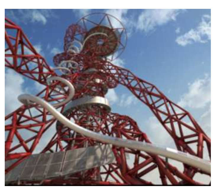
Figure 2: The Arcelormittal Obit Descender, Queen Elizabeth Olimpic Park, 2019, courtesy: olympic park.co.uk . Lois and Richard Rosenthal Center for Contemporary Art Zaha Hadid Architects