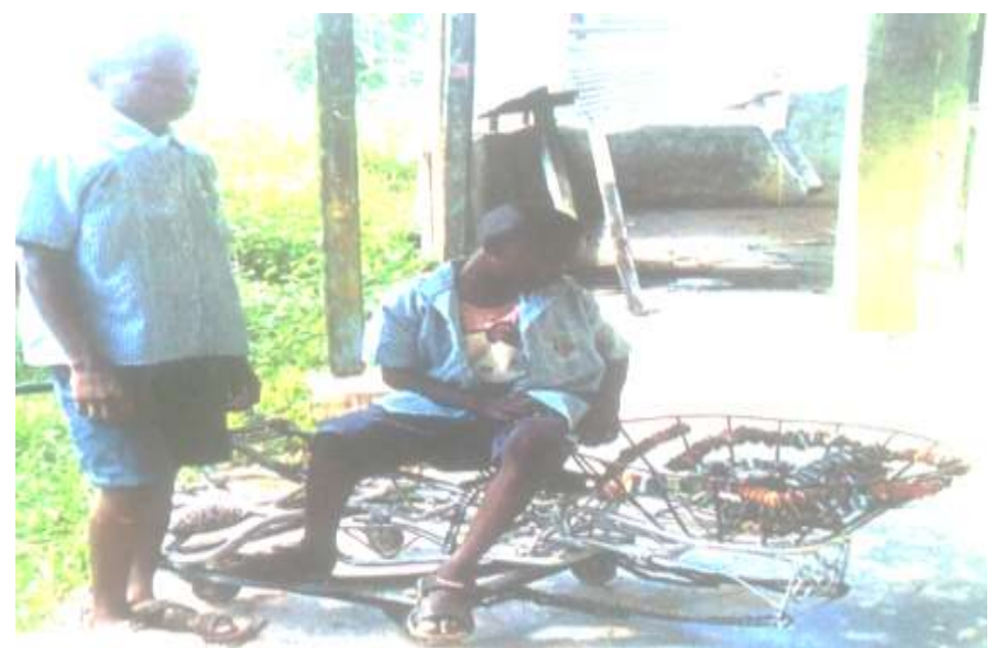
Figure 9: Children from Abraka model primary school playing with play sculpture model 4, 2016