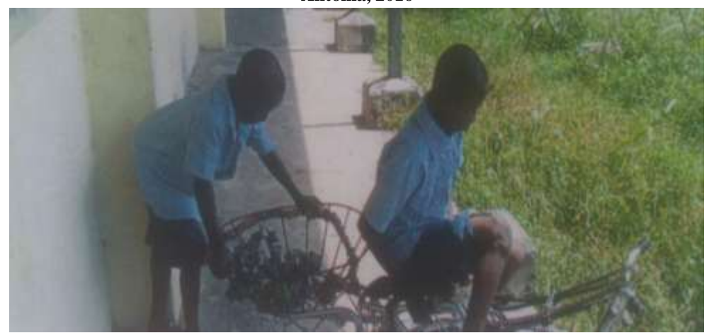
Figure 13: Children from Abraka model primary school playing with play sculpture model 8, Photograph: Okogwu Antonia