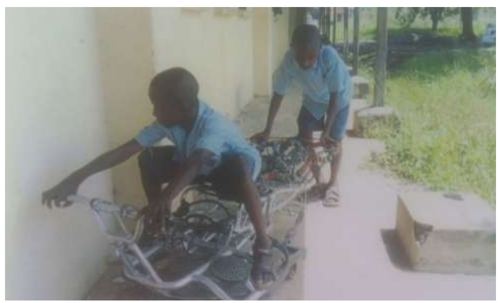
Figure 11: Children from Abraka model primary school playing with play sculpture model 6, 2016, Photograph: Okogwu Antonia