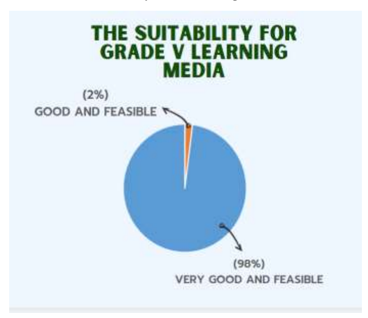
Figure 2. The diagram results of the suitability for Grade V Learning Media

The media's feasibility analysis was carried out to determine the suitability of media products developed. Based on the data table assessment and validation by the media expert team, it can be concluded that the feasibility assessment of the media aspects obtained a score of 63 out of 64 (98%). It is categorized as "very good and feasible" to be used in integrated learning for Grade V elementary school. Data from the validation analysis of media experts can be seen in the image below.