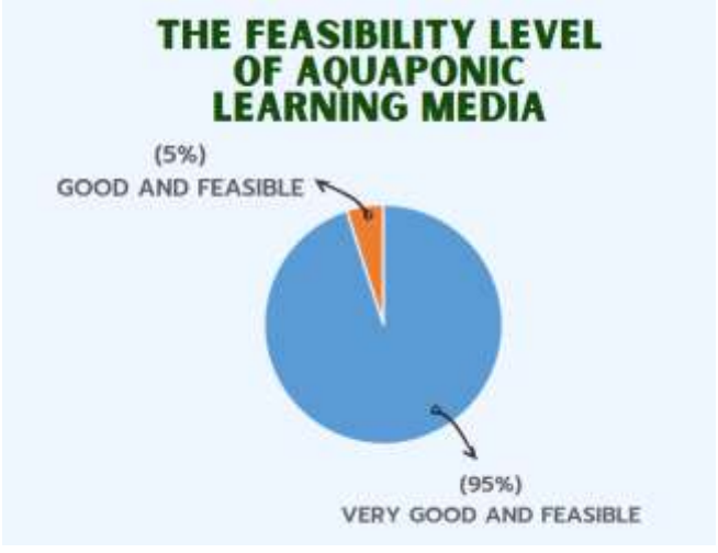
Figure 1. The diagram results from the feasibility level

The feasibility assessment of material aspects obtained a score of 57 out of 60 (95%). It is categorized as "very good and feasible" for use in integrated thematic learning in grade V elementary school students. The results of the analysis of material validation analysis can be seen in the image below.