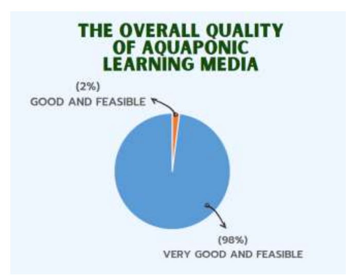
Figure 4. The diagram results of the overall quality of Aquaponic Learning Media