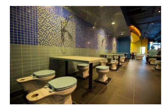
Figure 1: Examples of "theme hotel"