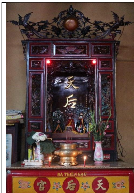
Tianhou's Altar at Guandi Temple

(No. 08, Le Minh Nguon Street, My Long Ward, Long Xuyen City)