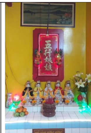
Wuxing Niangniang's Altar at Ông Bôn Fude Zhengshen Temple

(No.78, Pham Hong Thai Street, My Long Ward, Long Xuyen City)