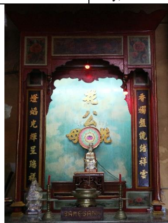
Songzi Niangniang's Altar at Thất phủ Temple

(No.10, Le Minh Nguon Street, My Long Ward, Long Xuyen City)