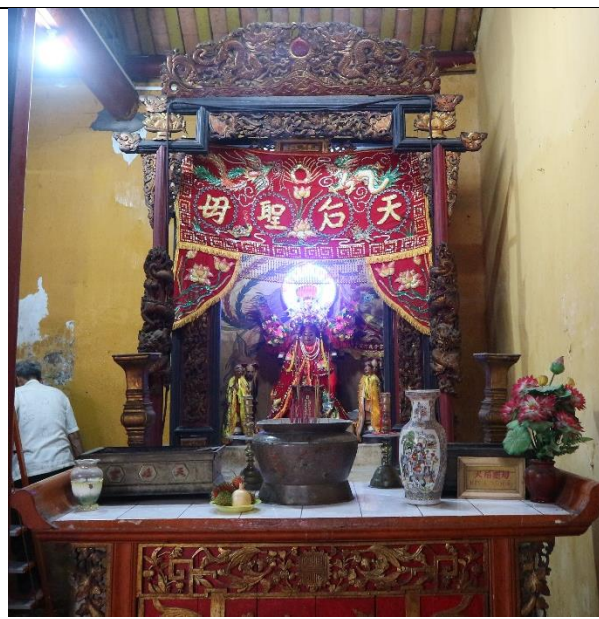
Tianhou's Altar at Ông Bắc Temple

(No. 08, Le Minh Nguon Street, My Long Ward, Long Xuyen City)