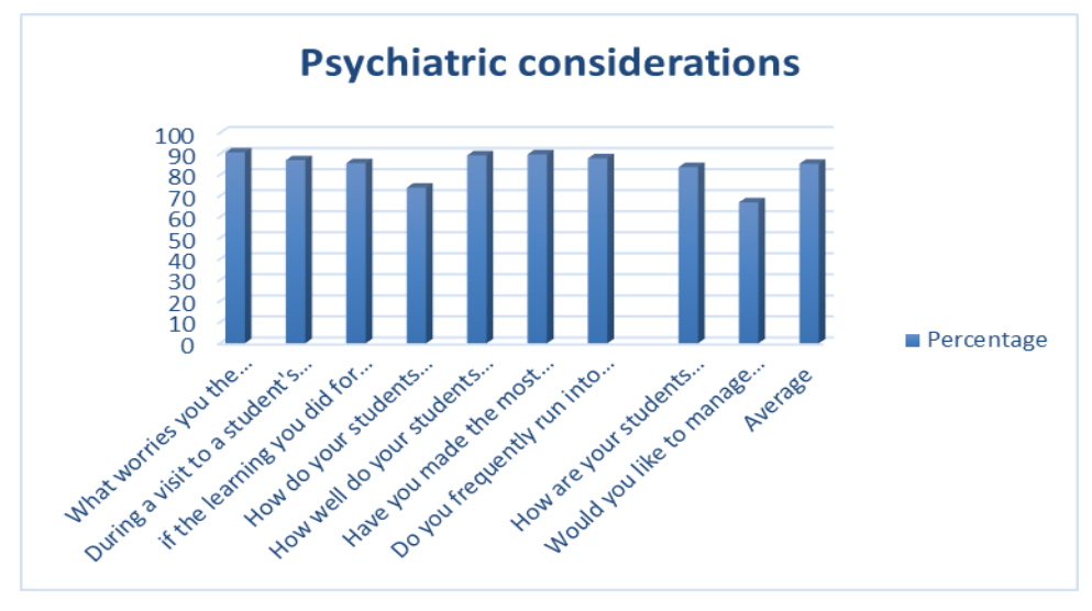
Figure 2. Chart Psychiatric considerations