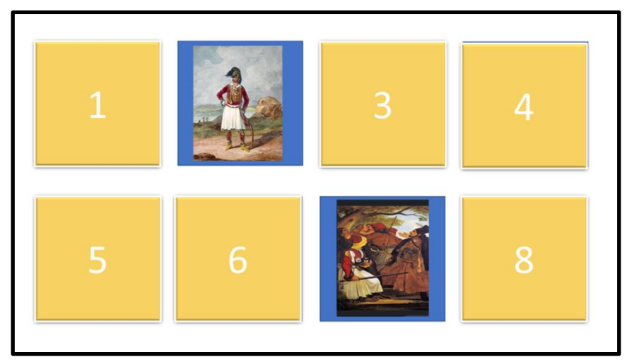
Picture 3: Digital memory game part of the educational material of the museum case

Shaffer's Early Learning Model (2019) was mentioned earlier, it describes fundamental 'key elements' for the child's knowledge building process. According to her, the constructivist approach places the child in a central position, recognising the child as an active individual engaged in dynamic situations of exploration, learning and getting to know the world around them (Shaffer, 2019). Also, Helm & Katz's (2011) view had been presented, where the importance of experiential learning was emphasised, as the experiential - communicative approach to the educational process shapes a particular climate in school life, which is far from that of the traditional school. It is worth noting at this point that all students were engaged both individually and in groups throughout the project.