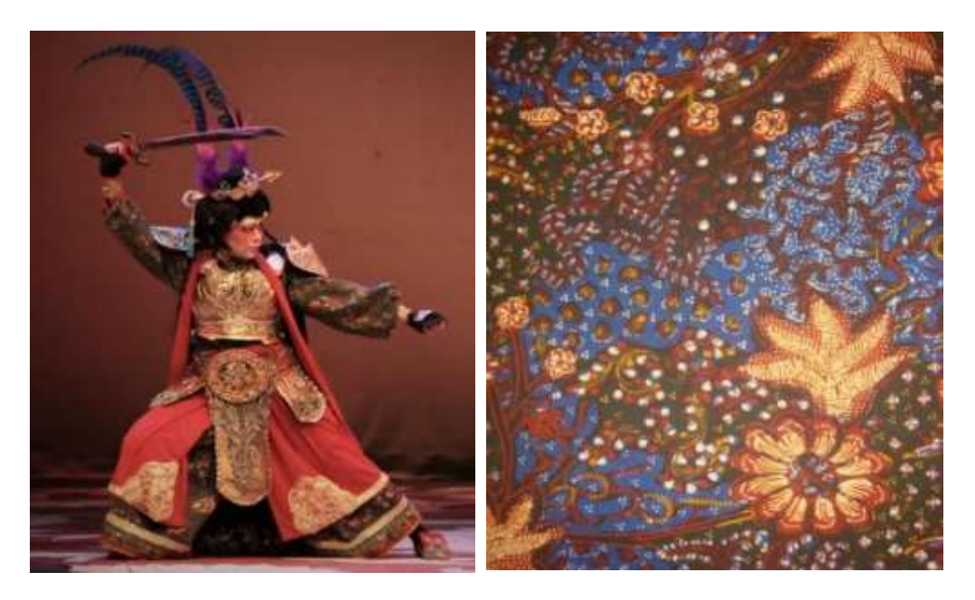
Hwan Lie Hoa Costume with Batik Lasem Teater Koma Documentation

Lasem batik which is famous for its uniqueness in terms of its manufacture and color is Tiga Negeri batik. This batik is the result of the acculturation of three cultures that interact with Indonesian culture, the three cultures include Javanese, Chinese and Dutch culture. Tiga negeri batik originated from Lasem District, Rembang, West Java in the 19th century, which is believed to be a stopover for ethnic Chinese immigrants from the south coast. This tiga negeri batik is used as one of the materials for the Sie Jin Kwie theater performance costume. The costume that uses batik is the costume worn by the main female character Hwan Lie Hoa, a great General of the Tang Dynasty and daughter-in-law of Sie Jin Kwie. In addition, Lasem batik is also worn by King Liti on his puffed pants.