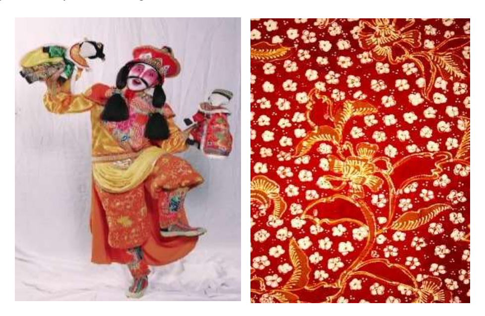
King Liti Costume with Batik Lasem

by Raja Liti is brighter, namely reddish orange.