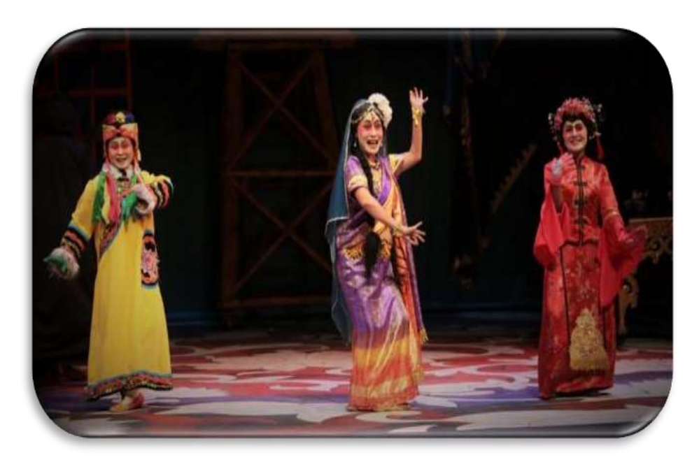
Tree Singers from Mongolia, India, dan Tiongkok Teater Koma Documentation

The theater costumes prepared for the Sie Jin Kwie Fights the Western Ghost performance produced by Teater Koma are very numerous. Although the background of the Sie Jin Kwie play is Chinese culture, not all costumes are inspired by Chinese cultural costumes, there are several forms of costumes from other cultures such as Indian and Mongol cultural costumes. Because in the story of Sie Jin Kwie there are characters from other countries, and this illustrates that the Tang Dynasty is open to other cultures. In the scene of the three trio of singers from different countries, it is clear that there is cultural interaction in the story of Sie Jin Kwie. The three singers come from India, Mongolia and China.