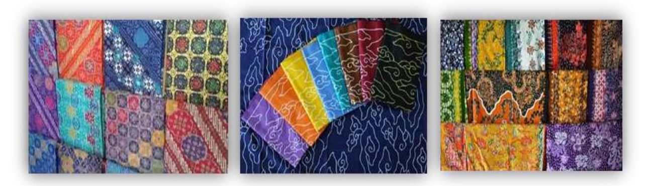
Batik Pekalongan<sup>7</sup>, Batik Cirebon<sup>8</sup>, and Batik Lasem<sup>9</sup>

Chinese influence on Lasem Batik, Pekalongan Batik, and Cirebon Batik can be seen from the bright colors typical of China and motifs adapted from Chinese cultural motifs, namely animal motifs such as Dragon/Liong, Hong bird, Butterfly, Crane, Turtle, and others, then floral motifs such as Rice and grains, pomegranate, Magnolia, Plum Flower (Meihua), and others. Pekalongan Encim Batik seems to lean towards the porcelain color scheme of famille rose, famille verte. Motifs from Chinese culture that are often found in Cirebon batik are fog or mega, qilin, hong bird, lung, banji, plum flower, lotus, turtle, dahlia flower, crane, bat, and several types of insects such as centipedes, butterflies, and so on.